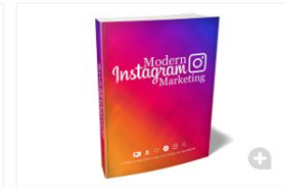
Modern Instagram Marketing