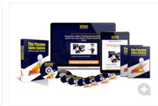
The Passive Sales System