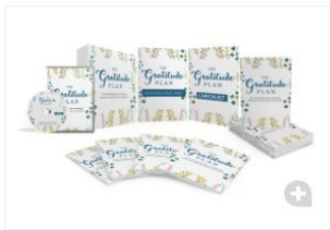
The Gratitude Plan Upgrade Package