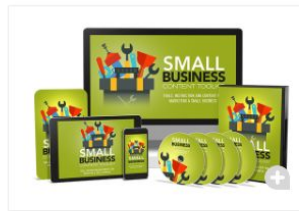
Small Business Content Toolkit