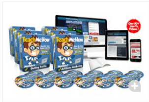
Teach Me How