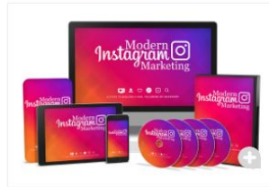
Modern Instagram Marketing Upgrade Package