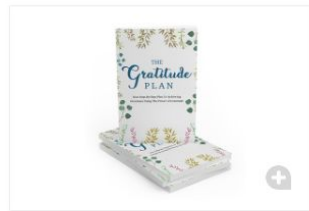
The Gratitude Plan